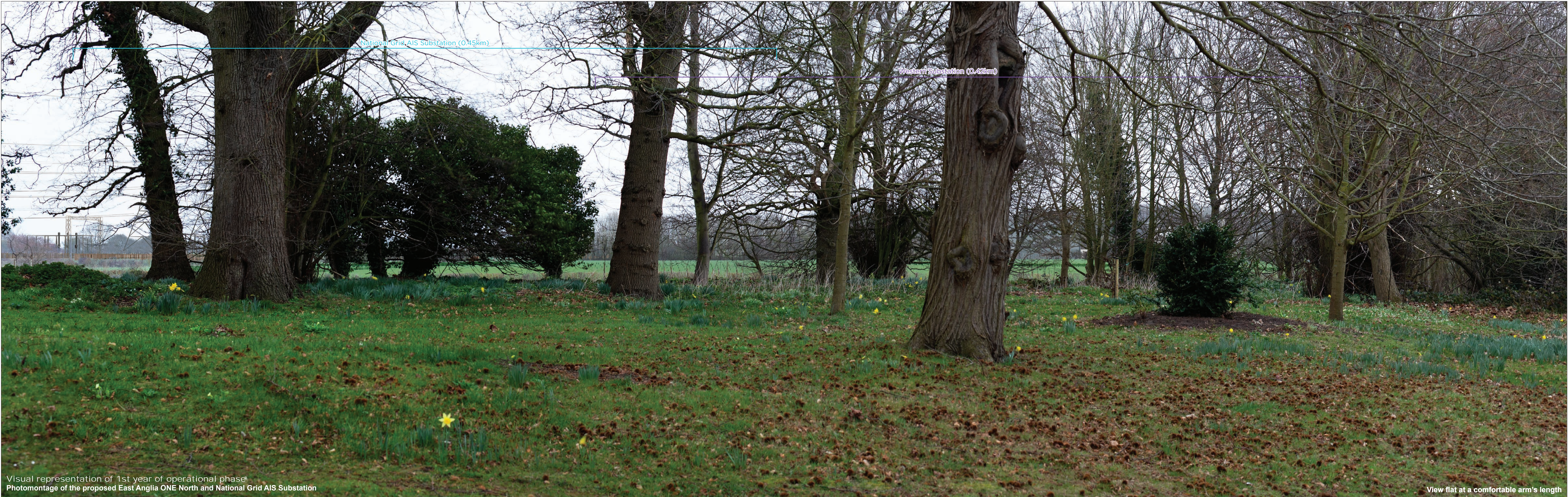
Visual representation of 1st year of operational phase Photomontage of the proposed East Anglia ONE North and National Grid AIS Substation