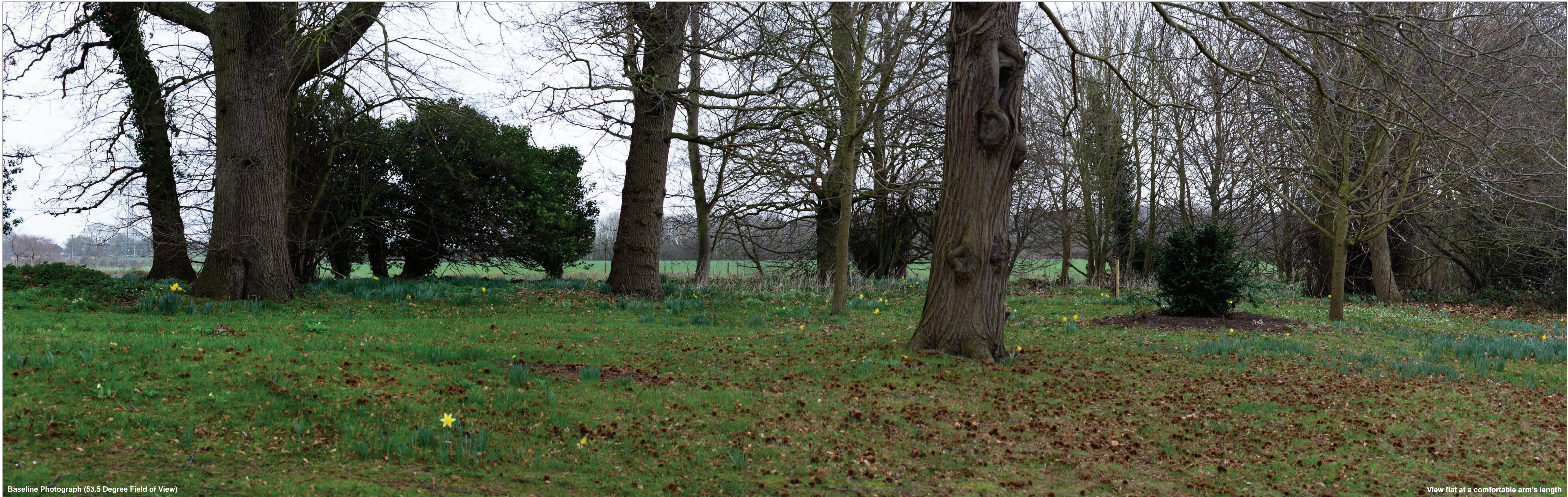
Baseline Photograph (53.5 Degree Field of View)