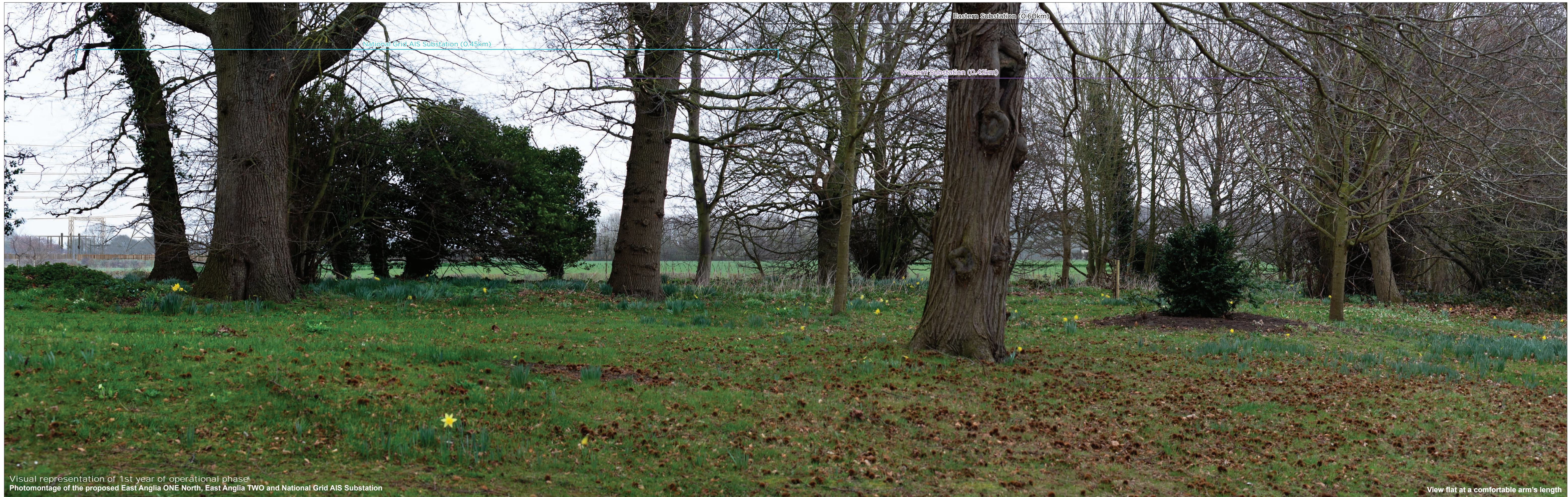
Visual representation of 1st year of operational phase Photomontage of the proposed East Anglia ONE North, East Anglia TWO and National Grid AIS Substation