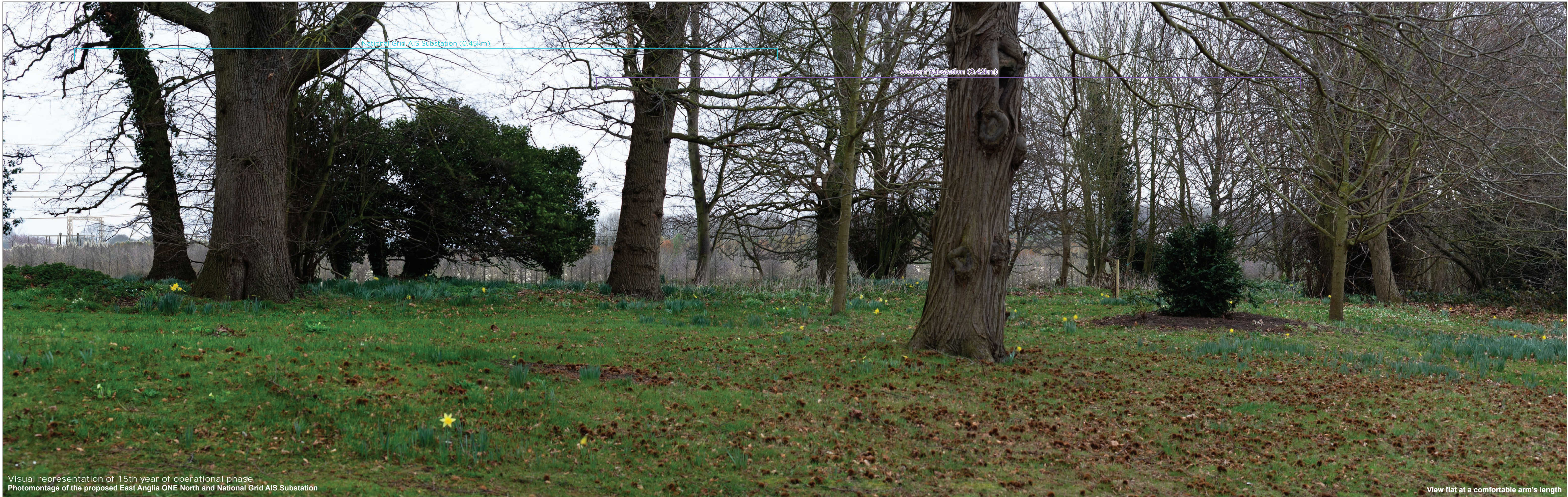
Visual representation of 15th year of operational phase Photomontage of the proposed East Anglia ONE North and National Grid AIS Substation